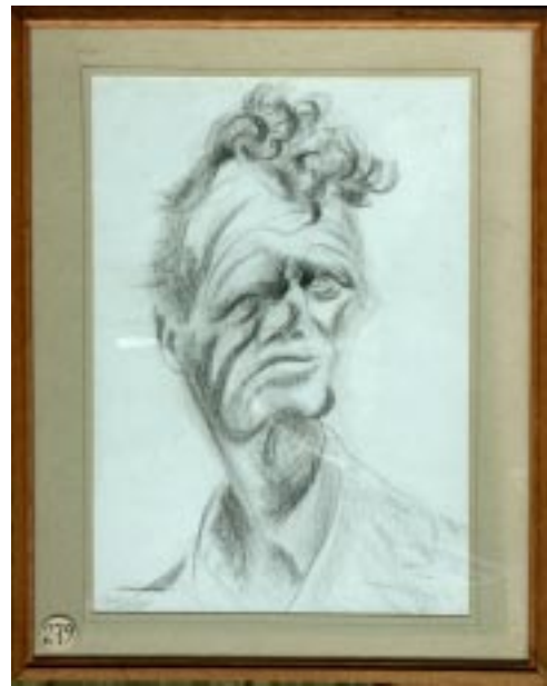
Head Study, 1987, 37x30cm, pencil (PICT2800)