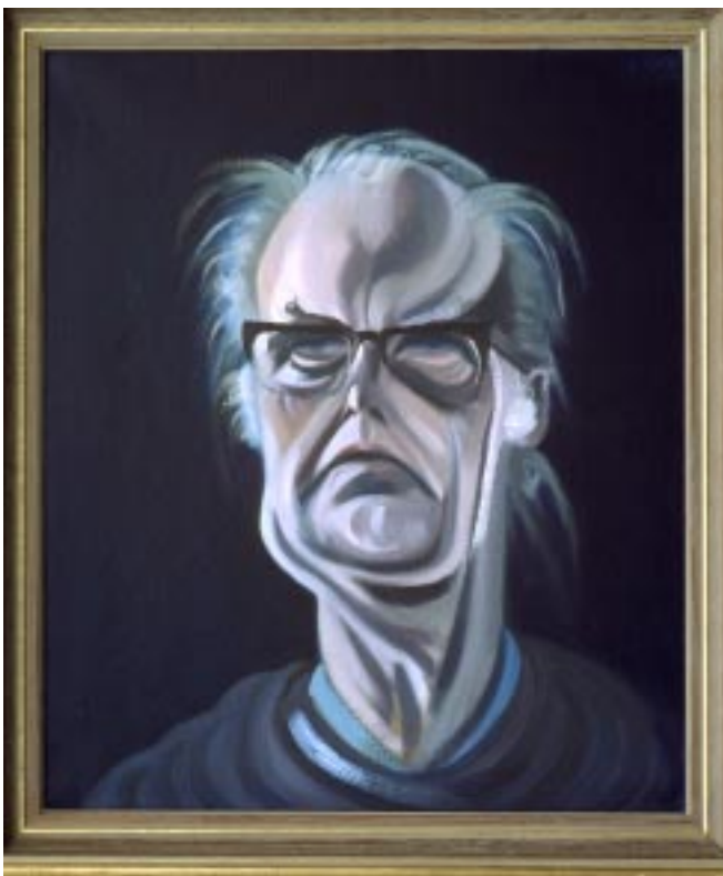
1976 Self Portrait 70 x 60cm (3643-05)