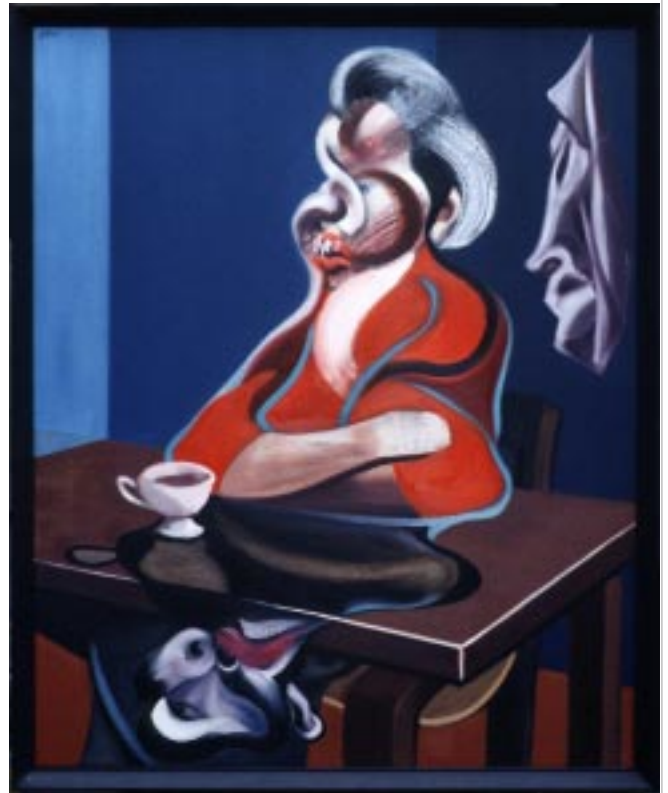
1977 Seated Figure 80 x 65cm (73-31)