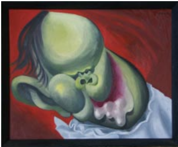
1974 No Title 45x55cm (Green baby PICT2805)