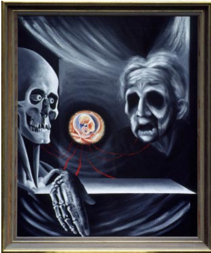
TAKEN!! 1974 Beginning and End 84 x 69cm TAKEN!!