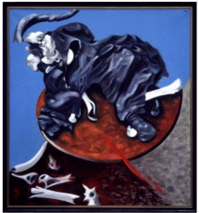
1978 Dead Elephant 105 x 95cm (95-15)