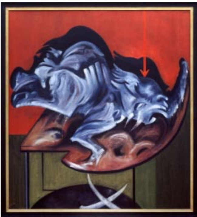
1978 Dead Elephant II 108 x 98cm (95-27)