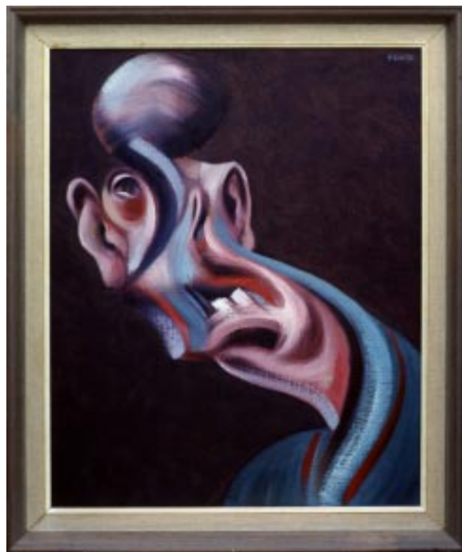
1978 Head Study I (73-28) 59 x 48cm