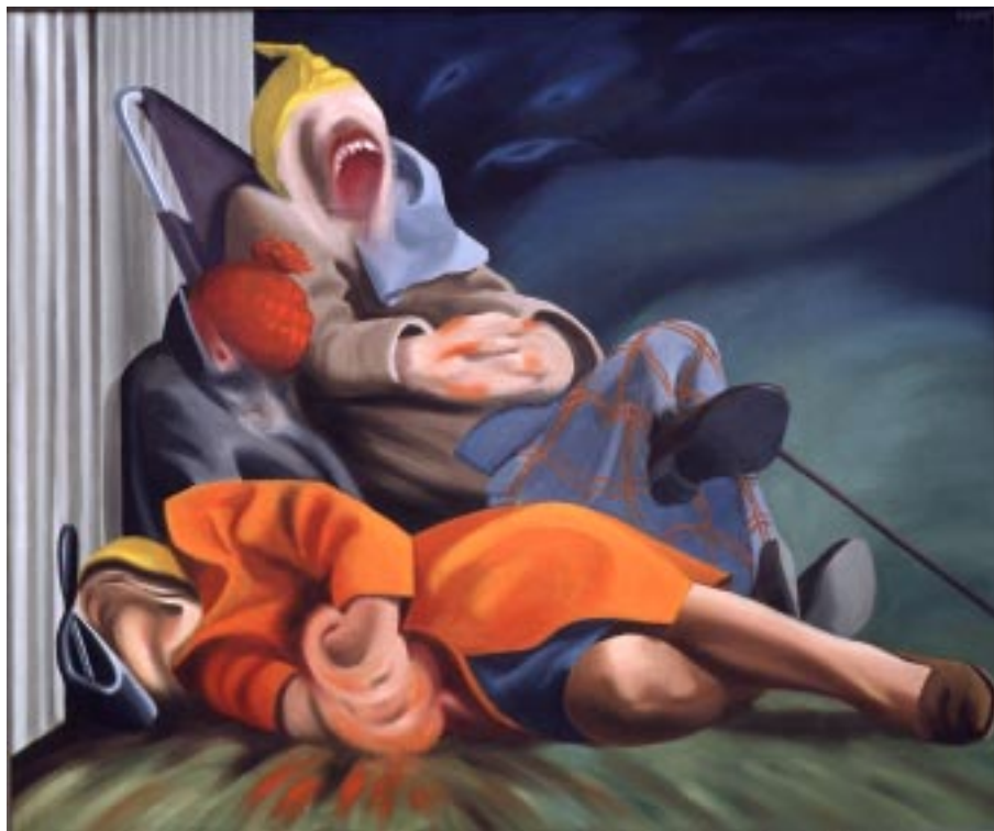
TAKEN!! (1975 Women Resting 82 x 100cm) TAKEN!!

Please note that the thumbnails shown here are not to scale. Some of the pictures are well over a metre square! They are all framed, oil on canvas except where shown.