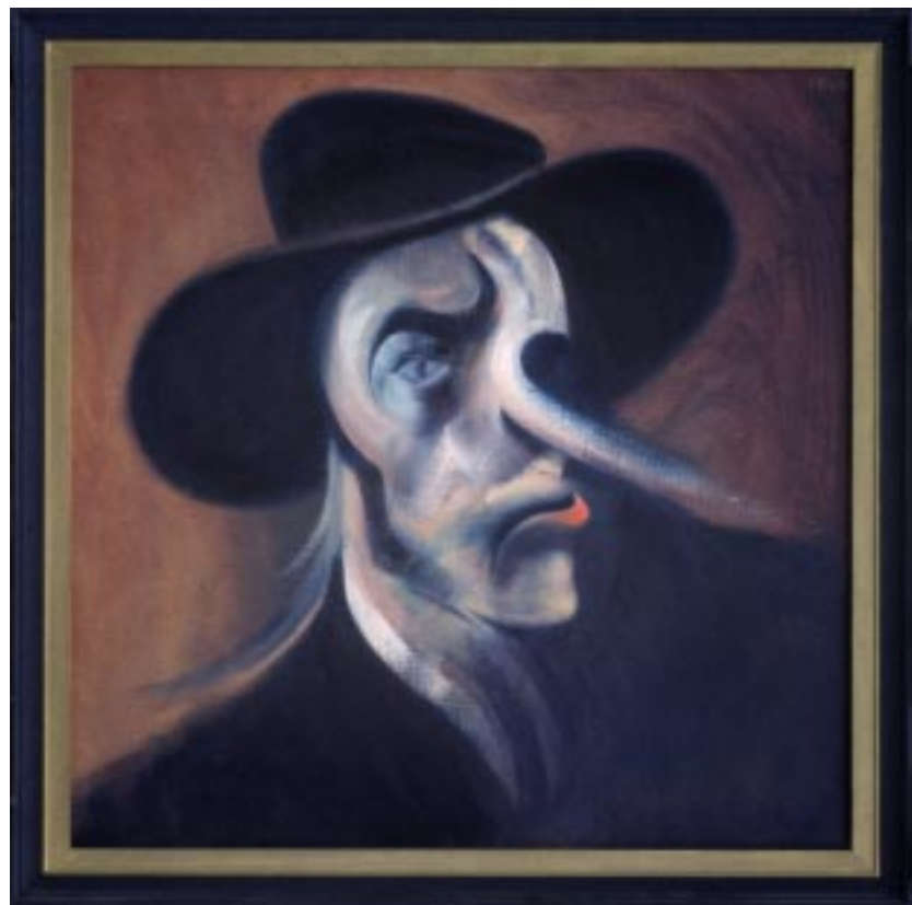
1979 Head Study 68 x 68cm (476-31)