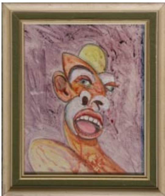
Head Study 1988, 31x26cm, ink & pencil (PICT2801)