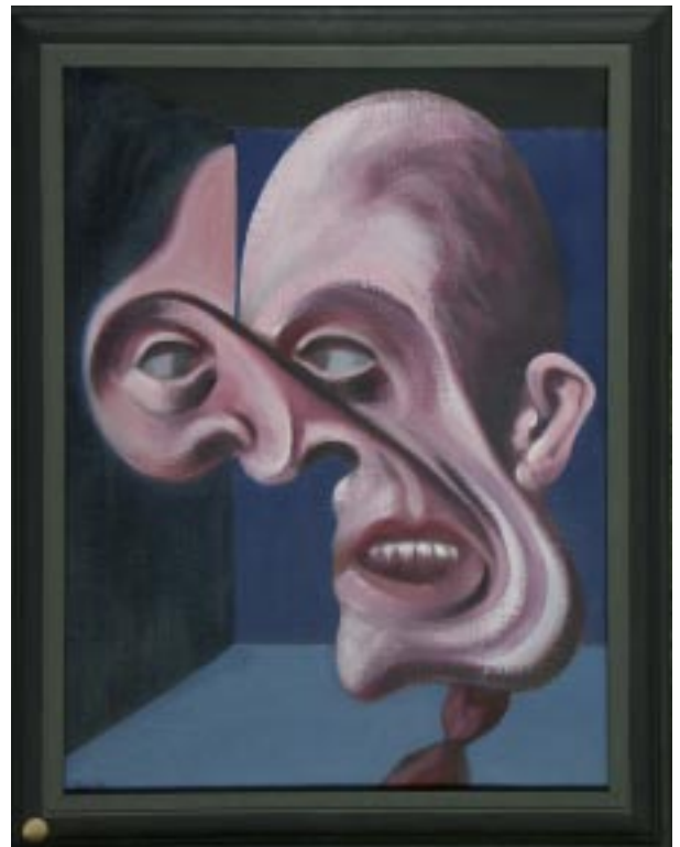
Head study II, 1979, 46x36cm, oil (PICT2797)