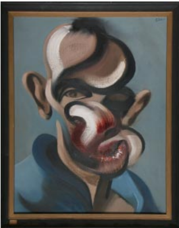
Head study II, 1977, 51x41cm, oil (PICT2796)