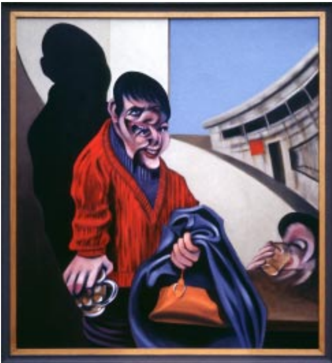
1979 Figure Study 109 x 100cm (95-14)