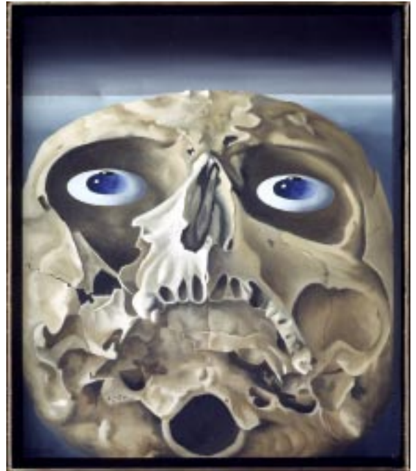
TAKEN!! (1973 No Title 63x53cm) TAKEN!! (skull & eyes)