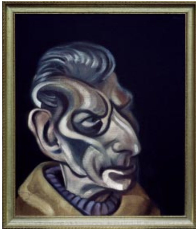
TAKEN!! 1977 Portrait of Samuel Becket 67 x 57cm TAKEN!! (73-21)