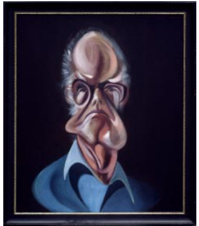
1978 Self Portrait 65 x 53cm (73-20)