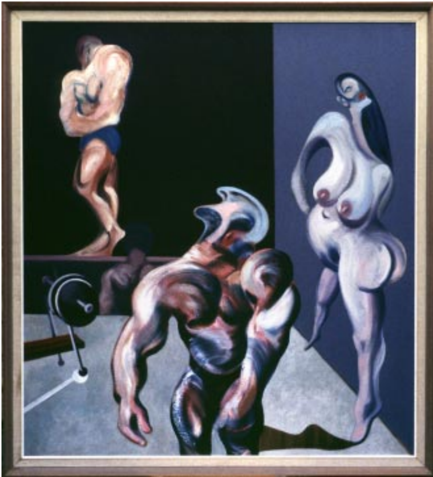
1978 Figure Study 109 x 98cm (95-17)