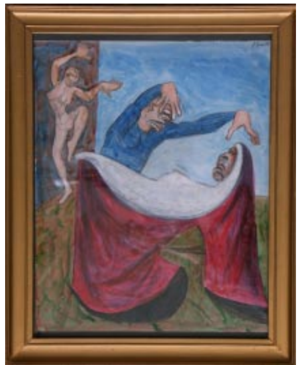
Figure Study II, 1988, 33x27cm, ink & pencil (PICT2802)