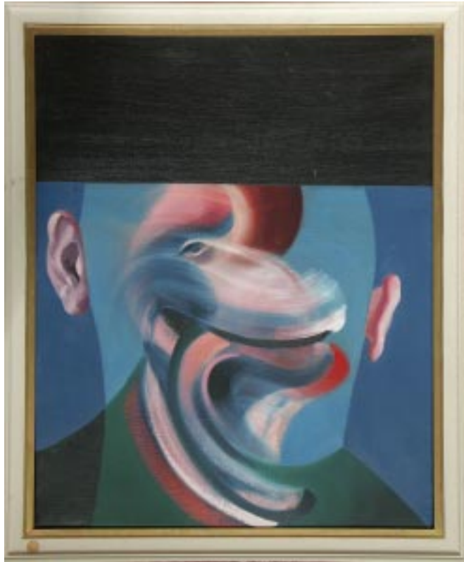
Head study II, 1978, 56x46cm, oil (PICT2794)