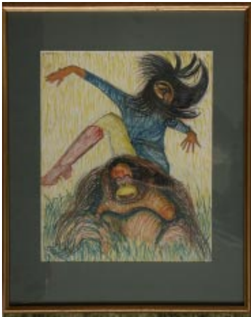
TAKEN!! Dancer, 1985, 39x32cm, water colour (PICT2798) TAKEN!!