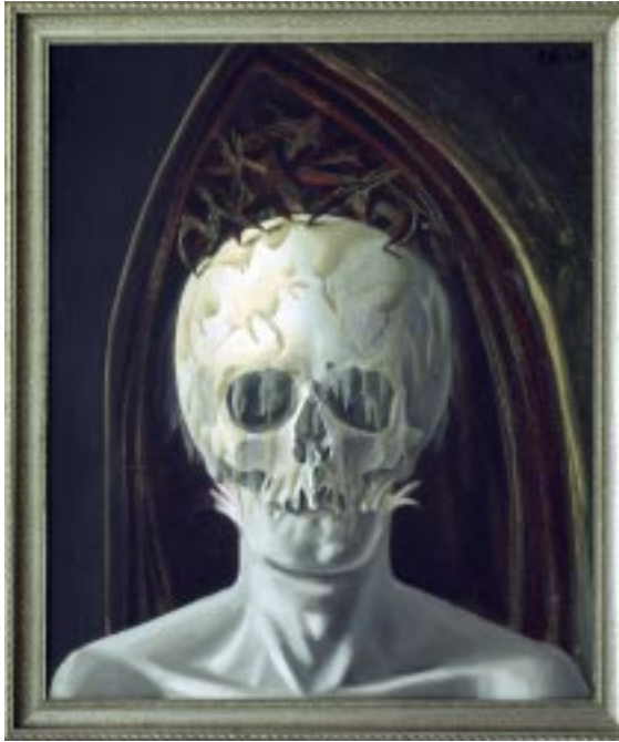
TAKEN!! (1973 Head Structure 68x57cm)